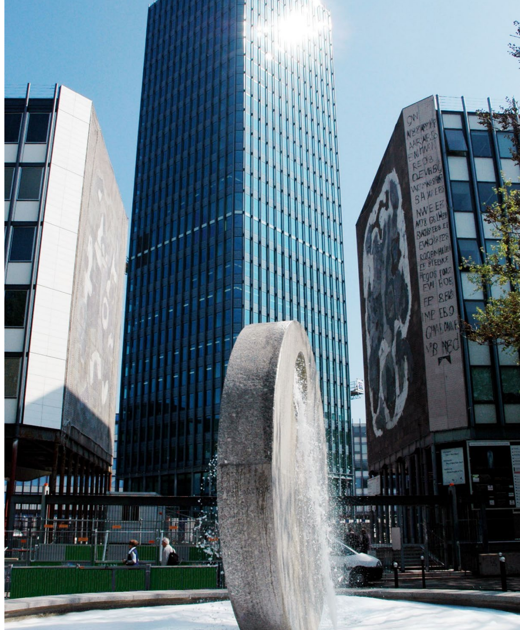
ENTRANCE TO THE PIERRE AND MARIE CURIE CAMPUS