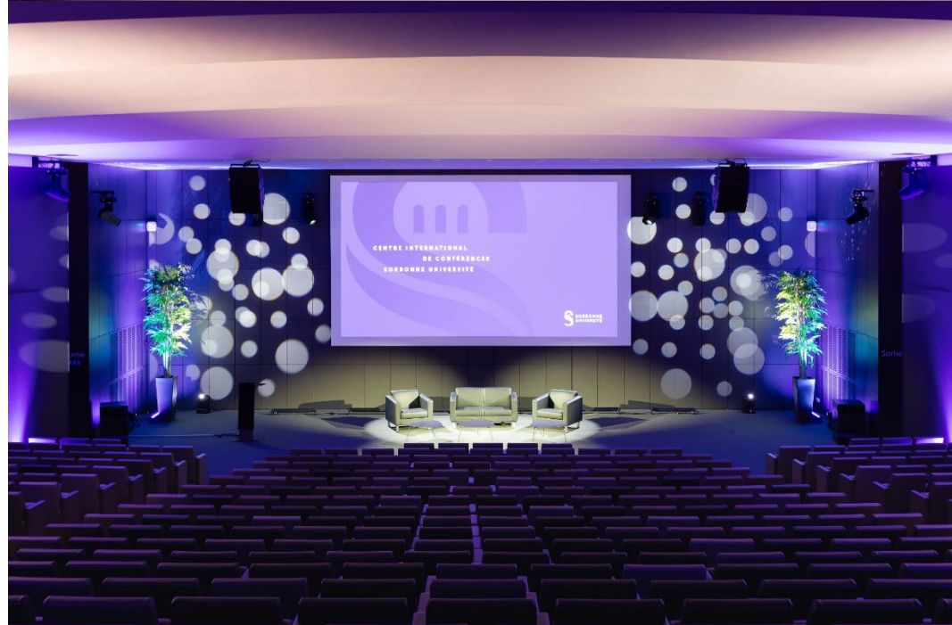
CICSU AUDITORIUM