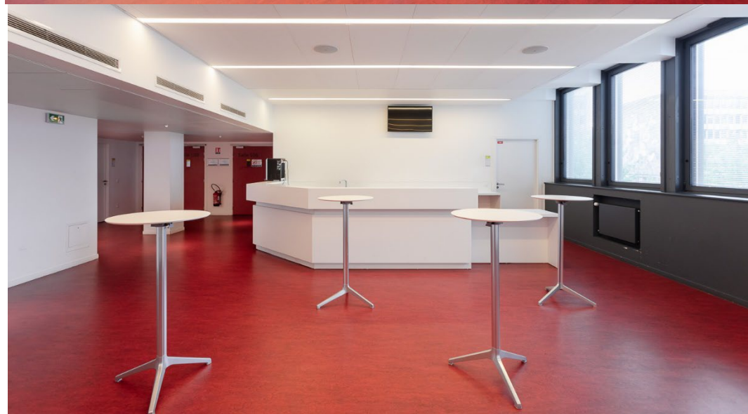
RECEPTION ROOM 102