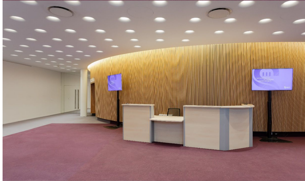
CICSU AUDITORIUM FOYER