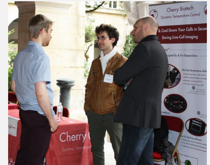
2016 : Forum Métiers de la Chimie 30 entreprises 250 doctorants et jeunes docteurs