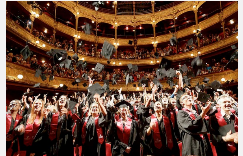
Cérémonie 2015 Promotion Ghislain de Marsily - plus de 400 diplômés présents avec leur famille et amis